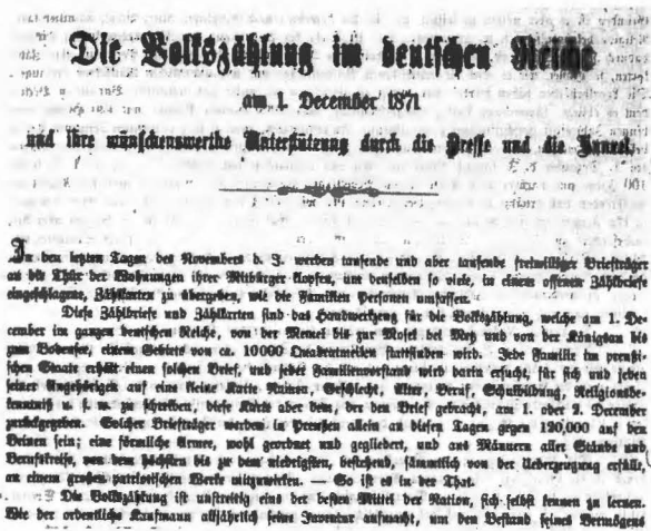
Figure 1. The first of four pages of the patriotic essay introducing the national census in 1871. The document was written by Dr. Ernst Engel of the Royal Statistical Office in Berlin.

Ernst Engel was the head of the Royal [not Imperial!] Statistical Bureau in Berlin. 6 This statement was probably not circulated among all of the states in Germany, but rather only in the thirteen Prussian provinces and a few other states. According to Puttkammer and Mühlbrecht, the instructions and forms emanating from Berlin in 1871 were used