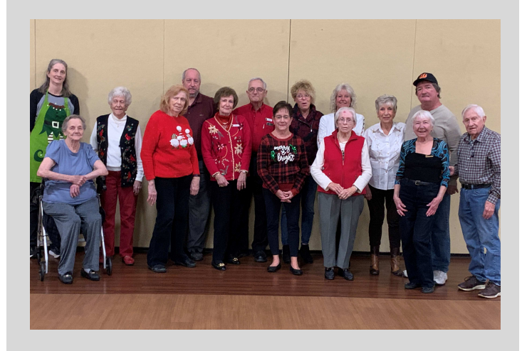
Past and present Tuesday Worker Cooks