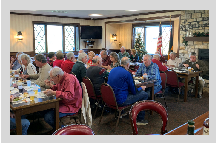
Chowing down on all the delicious food