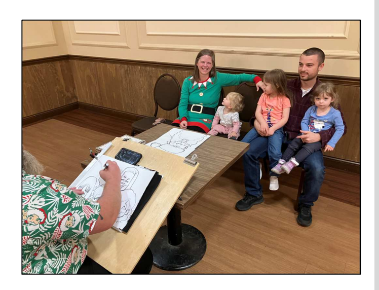
A Family Portrait