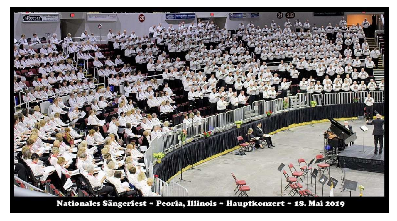
Photo of some of the participants at the National Sängerfest in Peoria, Illinois on May 18, 2019 where the Kolping Sängerchor participated.