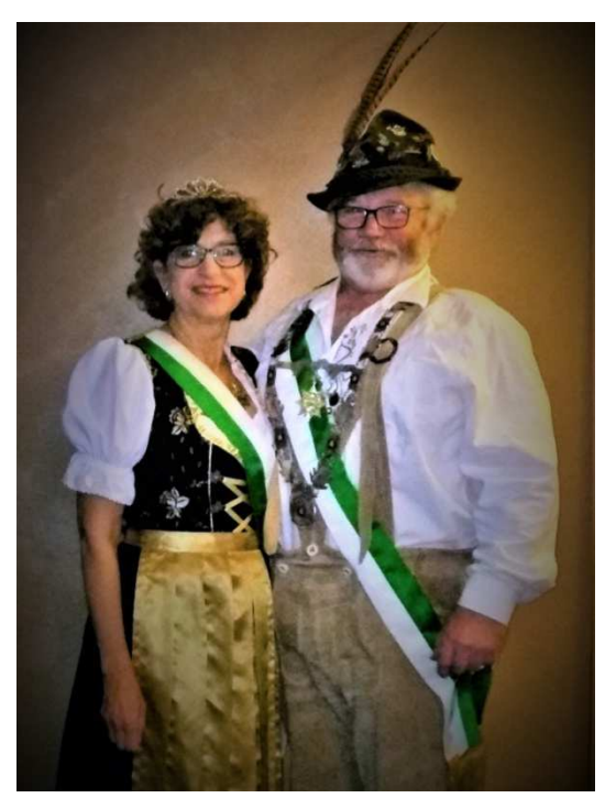
Cincinnati Kolping Center Saturday, January 6, 2018 8:30 PM

(The Last Night of the Twelve Days of Christmas)