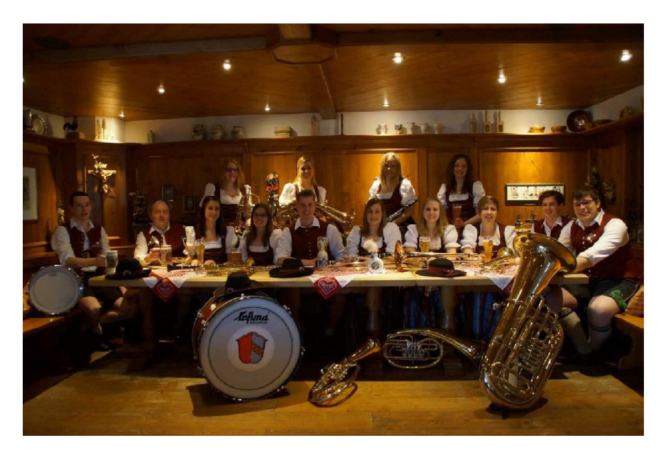
Saturday, September 9<sup>th</sup> at Clovernook Country Club 2035 West Galbraith Road, Cincinnati, Ohio 45239

No Admission Charge, Special German menu and German Biers 5PM ~ 11PM Band will perform from 6 – 10 Cash and Credit Cards accepted ~ pay as you go Reservations required